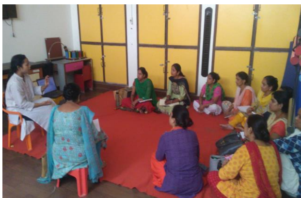
Weekly workshop for staff to update their knowledge about the disability conditions and latest interventions.