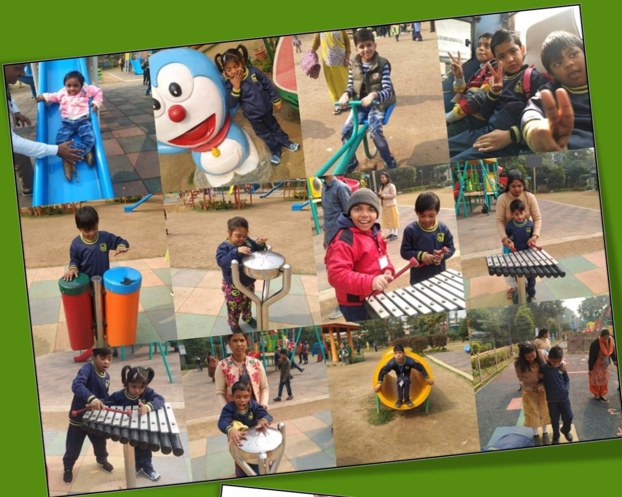
Children's day out to the sensory stimulation park in South Delhi