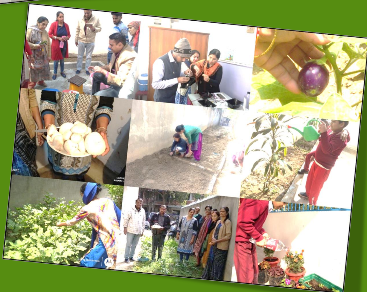
Workshops on preparation of natural fertilizers and mushroom culture were held for teachers and mothers to train the children in gardening as part of the prevocational training and Women's empowerment programme. Projects implemented at both Dwarka and Dakshinpuri centers.