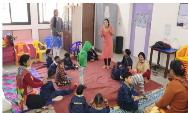
Creative Movement Therapy Workshop for Project staff and storytelling time for children