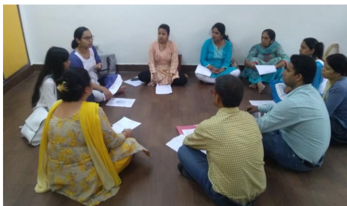
Case Conference – staff and professionals discuss the overall development, the challenges in children